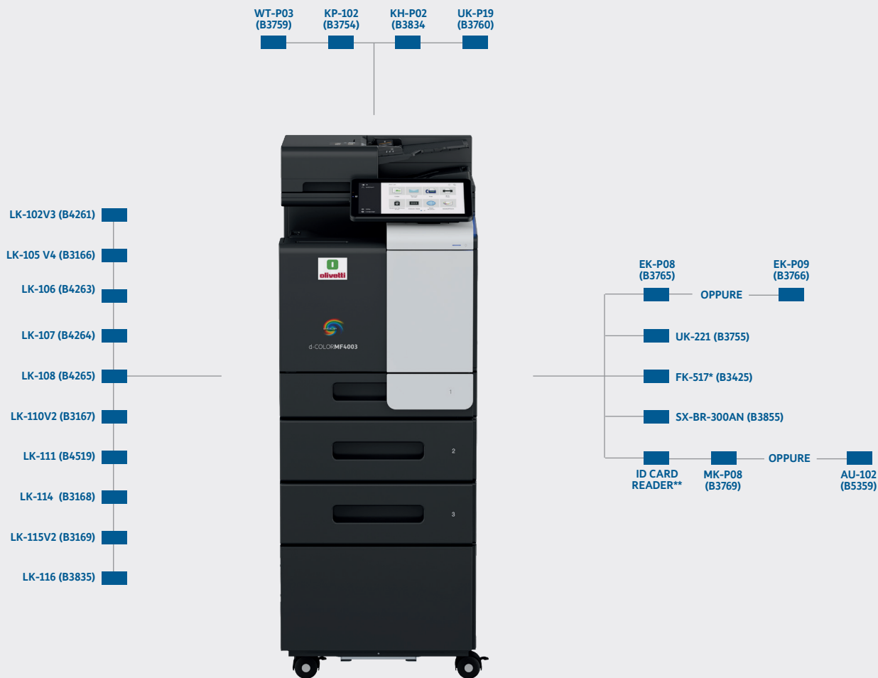
d-Color MF3303 (B3741) d-Color MF4003 (B3742)