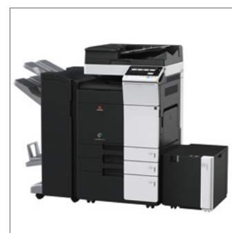
Configuration with FS-534SD Finisher, PC-410 Tray, LU-302 Large Capacity Tray, and DF-704 Document Feeder