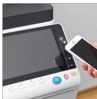
New area for Near Field Communication (NFC) Authentication