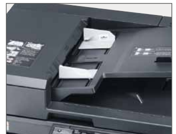
Rapid first-copy time: 5.7 sec.

Finally, the ID card copy function allows you to copy both sides of an original ID card in one operation on to a single sheet and the layout mode enables you to downsize two or four originals to make them fit on to one page.