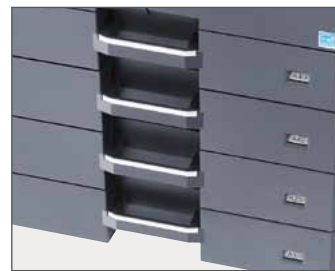
Paper capacity up to 1,300 sheets