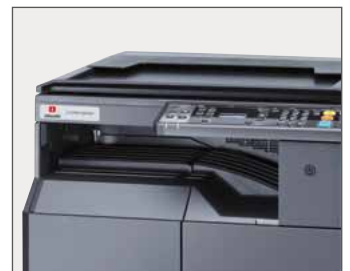
Colour scanner via TWAIN protocol