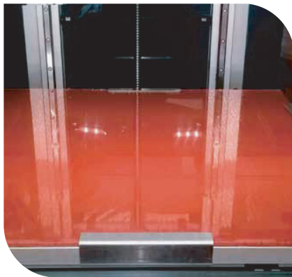
Very large heated bed in tempered glass, for high operating temperatures