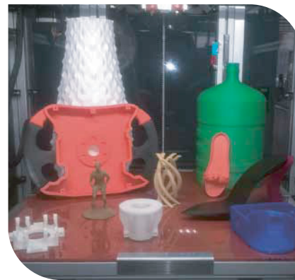
Large formats, multi-materials, multi-colors, infinite number of applications